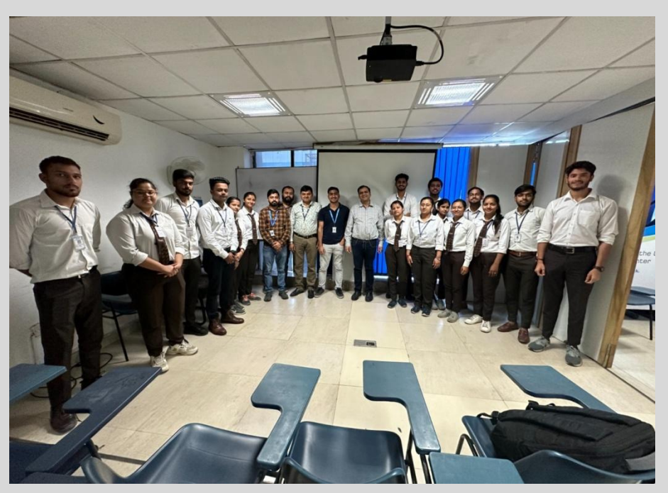
Industrial Visit at "Truechip Solutions", Noida