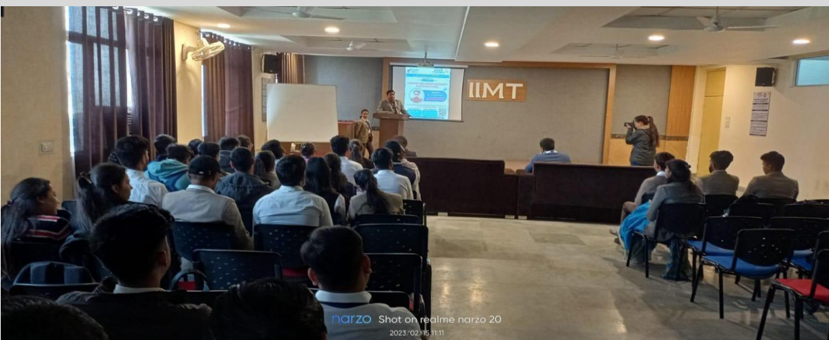
Guest Lecture on Innovating Self Screen and Identify Right Opportunity